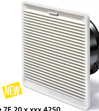
Type 7F.20.x.xxx.4250 250 m 3 /h