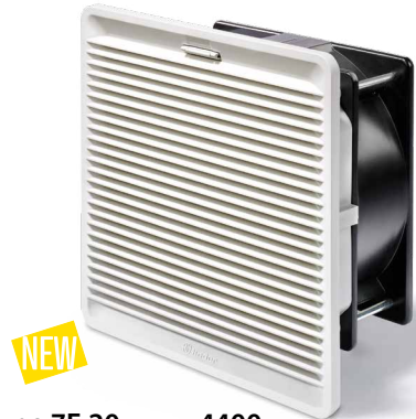
Type 7F.20.x.xxx.4400 400 m 3 /h